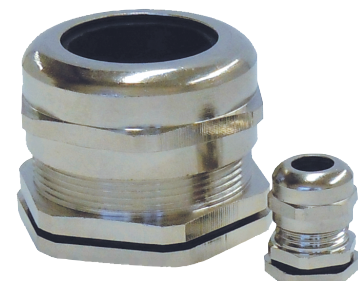
Nickel Plated Brass