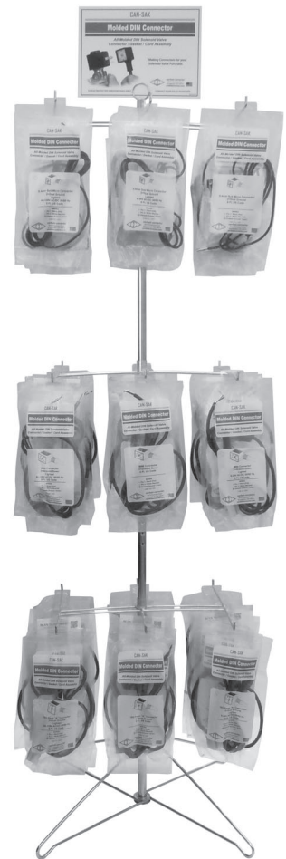
Fully populated rack assembly.